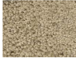
Cashmere Carpeting Living room