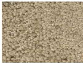
Cashmere Carpeting Stairs, Hallway, Bedrooms