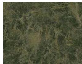
Jade Fusion Countertops Rear bath