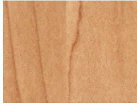
Recycled Maple Flooring Entryway, Kitchen, Powder room