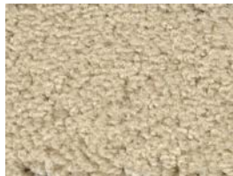
Cashmere Carpeting Stairs, Hallway, Bedrooms