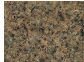
Mesa Sunrise Countertops Powder room