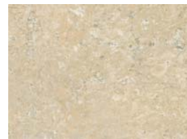
Tumbled Roca Countertops Upstairs Bathrooms