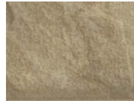
Vinyl Flooring Upstairs bathrooms