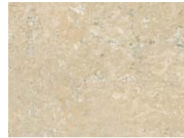
Tumbled Roca Countertops Rear bathroom