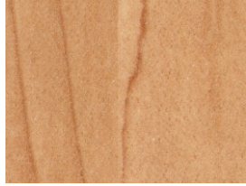
Recycled Maple Flooring Entryway, Kitchen, Powder room