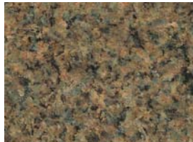
Mesa Sunrise Countertops Master bathroom