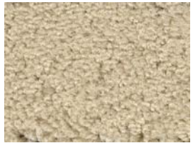
Cashmere Carpeting Stairs, Hallway, Bedrooms