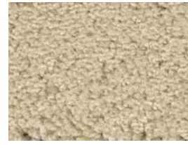
Cashmere Carpeting Living room