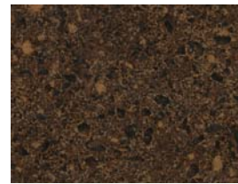
Brazilian Topaz Countertops Powder Room