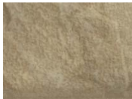
Vinyl Flooring Rear Bath