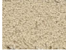
Cashmere Carpeting Living room