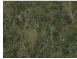
Jade Fusion Countertops Powder Room