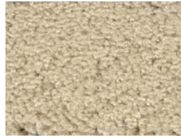
Cashmere Carpeting Stairs, Hallway, Bedrooms