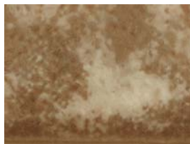
Vinyl Flooring Master Bathroom