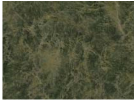
Jade Fusion Countertops Kitchen